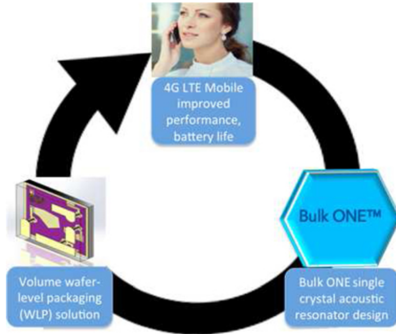
Figure 1—Our Solution

Moore's Law predicts that transistor density on integrated circuits will double approximately every two years, and the digital baseband of mobile devices has improved exponentially as predicted by Moore's Law. However, improvements to the analog RF front-end have been limited by existing filter technology, with only incremental updates to existing technology. Consequently, the RF front-end is taking up an ever-growing share of the total cost of mobile devices. Most mobile devices sold today operate on "fourth generation" wireless technology, or 4G. There are nearly fifty 4G bands recognized worldwide today, and the list is growing. The RF front-end must meet these growing data demands while reducing cost and improving battery life. Our solution involves a new approach to RF component manufacturing, enabled by Bulk ONE technology. Our technology will produce filters that will reduce the overall system cost and improve performance of the RF front-end.